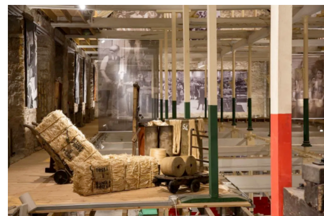
Opportunity Marketing & PR Manager position open at Dundee Heritage Trust