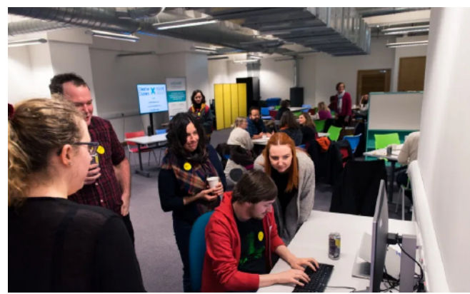
Event Thurs 27 February InGAME Insights #2: Activism & Video Games