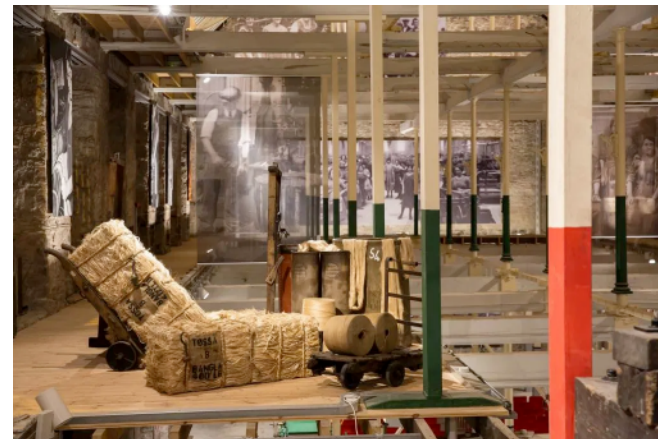
Event Learn about mutual exchange systems for creative communities in a special time banking workshop